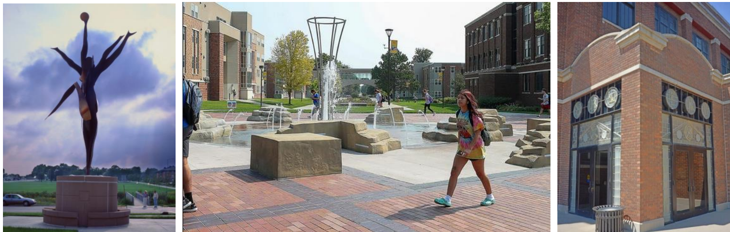
Some nearby artwork and experiences on campus: "Athleta" by John Raimondi, the Cope Fountain, cast glass entrance to Copeland Hall.

UNK is a Nebraska Statewide Arboretum site near the heart of the charming and growing city of Kearney, which has numerous cultural activities, restaurants and parks. UNK has emphasized the renovation of campus buildings and amenities over the last decade, and has many public artworks around the campus. Students come to UNK from 91 of the 93 Nebraska counties, all 50 states including the District of Columbia, and over 50 foreign countries.